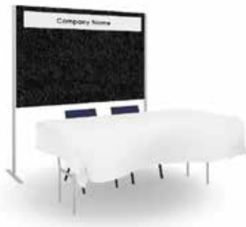
Table Top Display

it's a vibrant nexus where the future of respiratory healthcare converges. Furthermore, the Education Hub spans a comprehensive array of topics, many of which align closely with your products. This creates an unparalleled platform to interact with professionals and specialists who are directly involved with patients benefiting from these products. It's an energetic, interactive space to showcase your innovations and forge lasting connections with the front-runners of respiratory health.